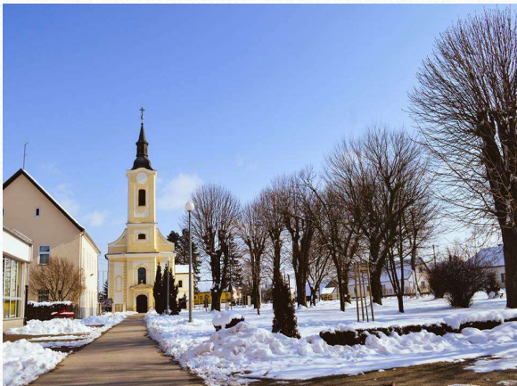
Church of St. Roch next to the park