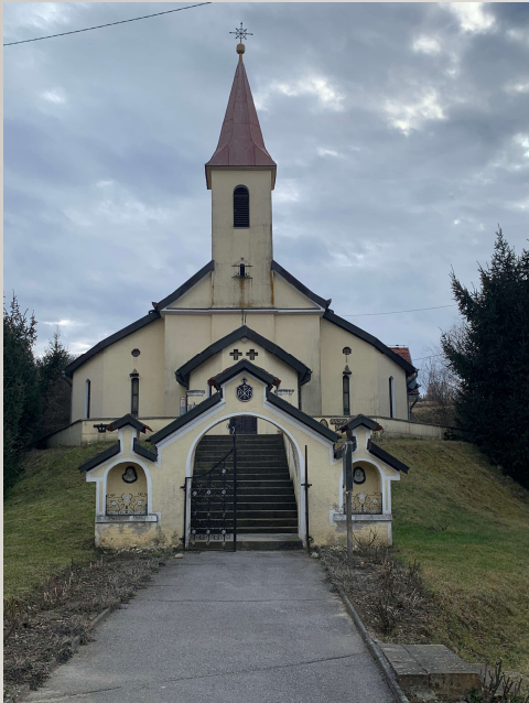
Church of the Mother of God